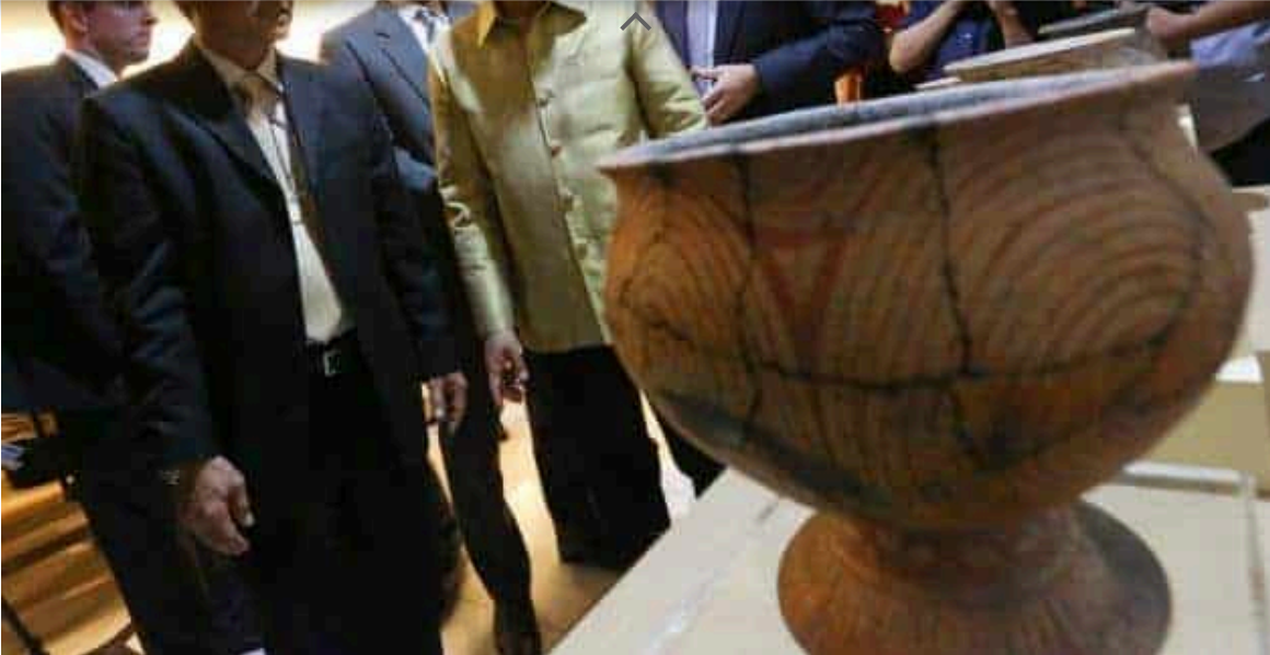
Return of Ban Chiang artefacts from the US.