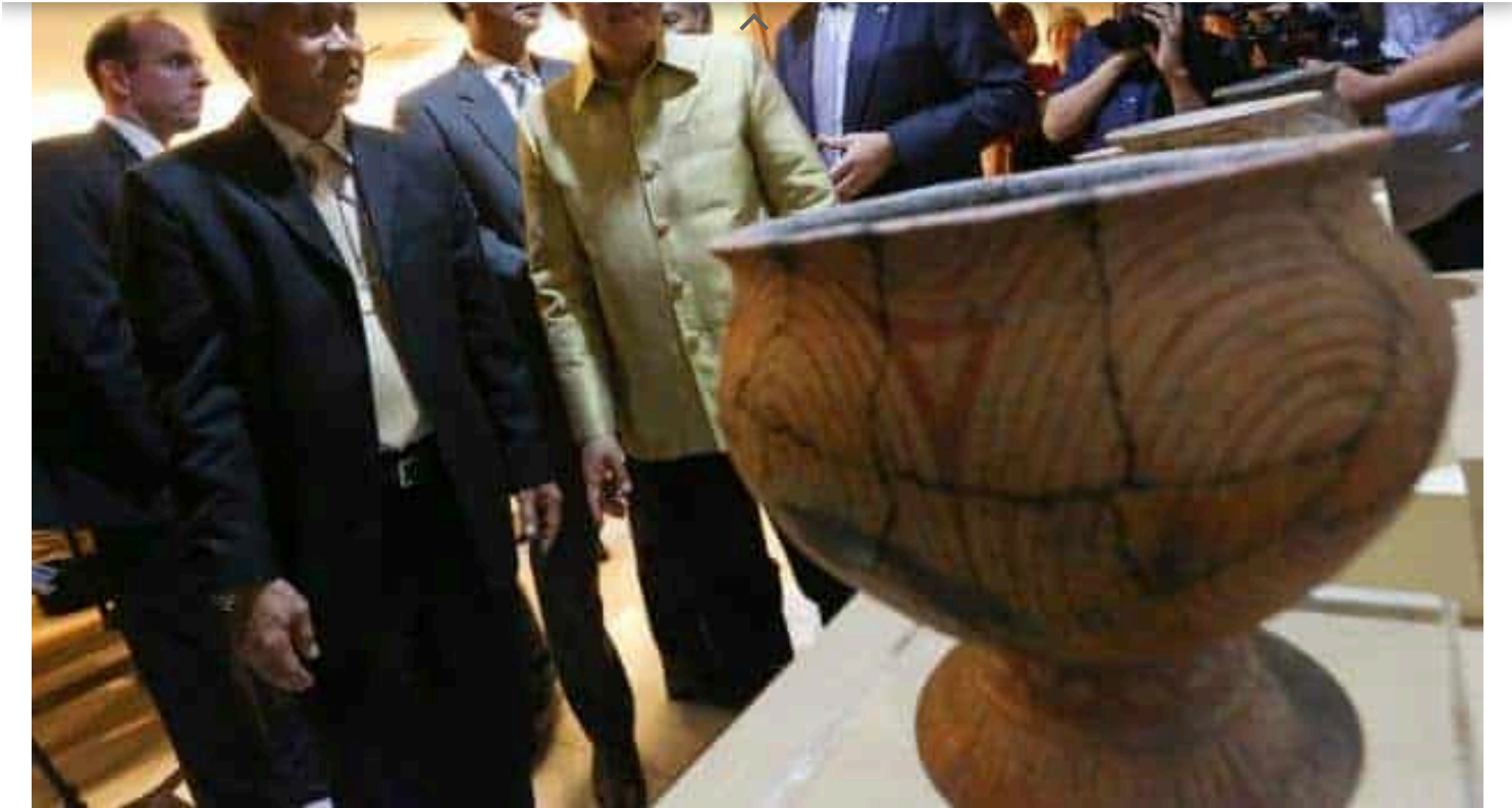
Return of Ban Chiang artefacts from the US.

Last week, over 500 artefacts from Thailand were officially handed back to the country from the Bowers Museum in the US. The artefacts were mostly from Ban Chiang, and the looted properties included bronzes and painted pots.